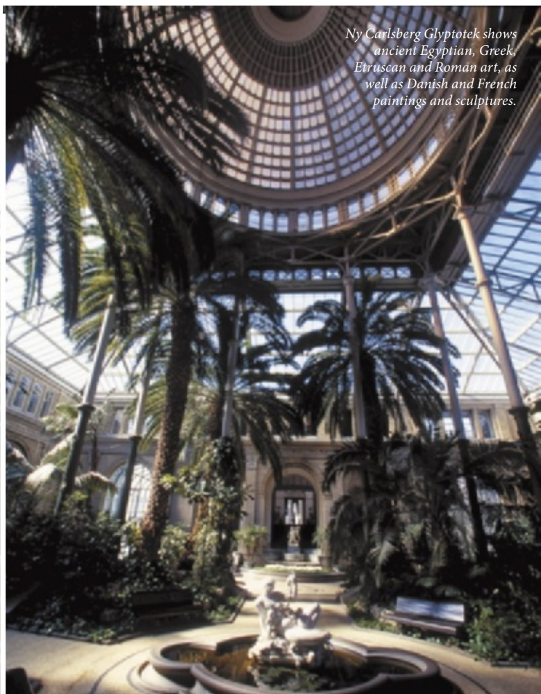
Ny Carlsberg Glyptotek shows ancient Egyptian, Greek, Etruscan and Roman art, as well as Danish and French paintings and sculptures.