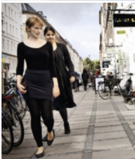
Shopping in Copenhagen is diverse – from vintage to new designers.