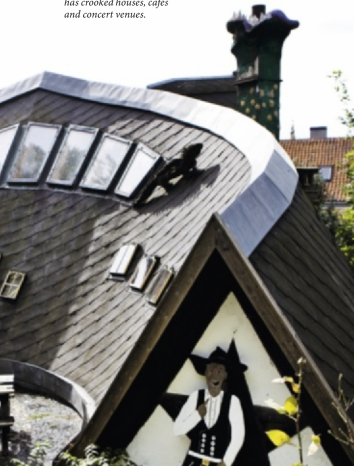
Freetown Christiania has crooked houses, cafés and concert venues.